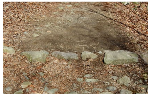
Mr. BAD BAR: The bar is running perpendicular to the trail causing water to pool behind it during wet weather.