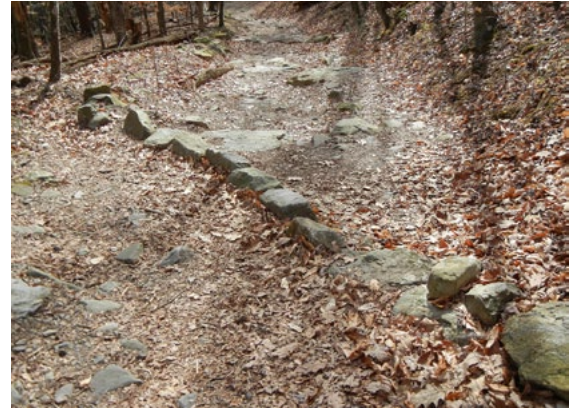
Mr. GOOD BAR: Water easily sheets off the trail thanks to the 45 degree angle of this bar.

Basic water bar maintenance is covered in our Introduction to Trail Maintenance workshop, while more advanced construction techniques for water bars and other water management structures are covered in our new, Tread and Drainage workshop. If your trail has problem water bars or other drainage issues, consider taking this course when it is offered in a region near you. 🐾