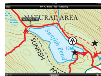
Enlarge maps using high-resolution mobile device displays